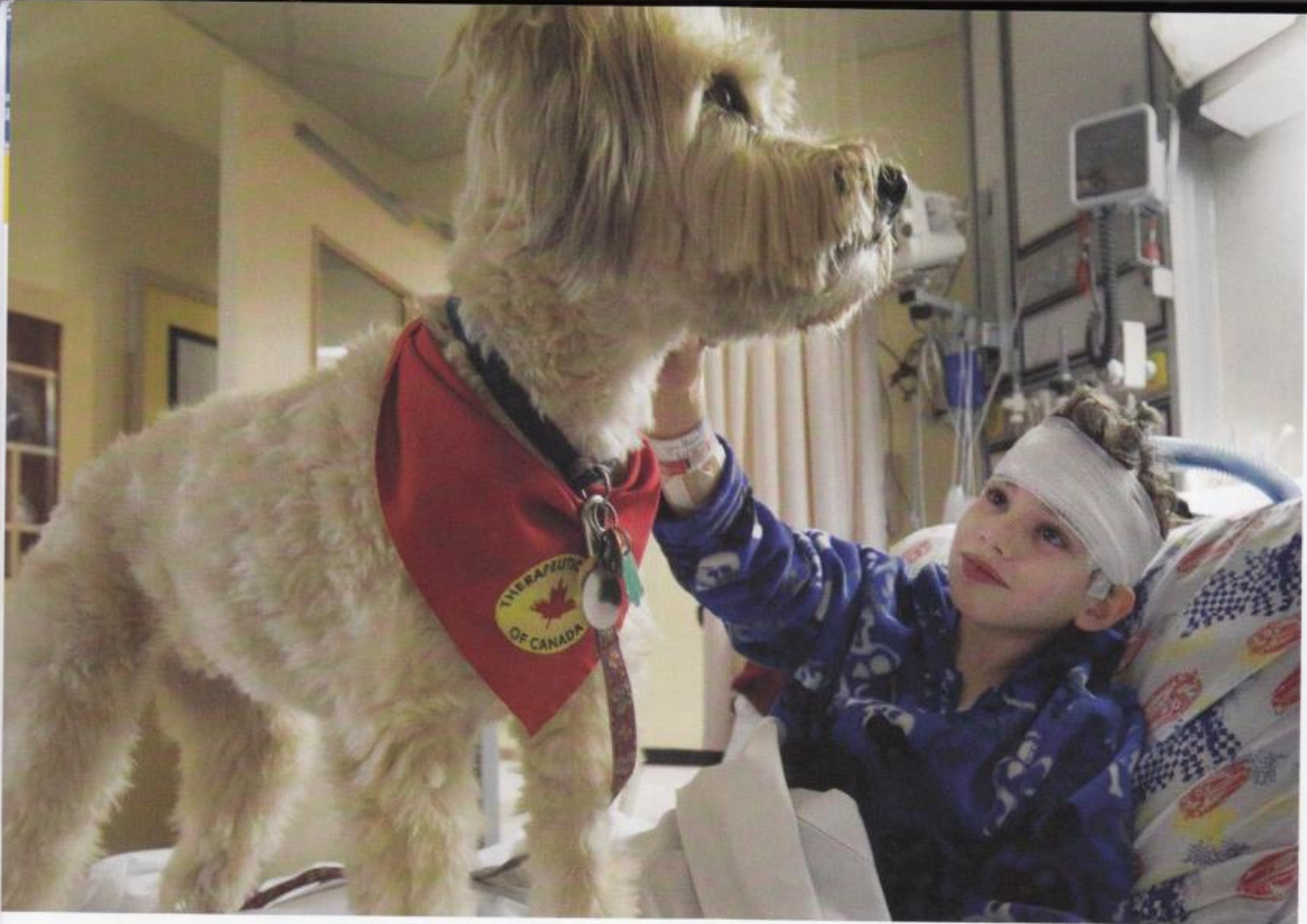
^ Shaynee the therapy dog visits children in the hospital.