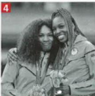
Venus and Serena Williams, tennis players

Venus and Serena Williams are American. _____ parents are from the United States. _____ mother is from Michigan and _____ father is from Louisiana.