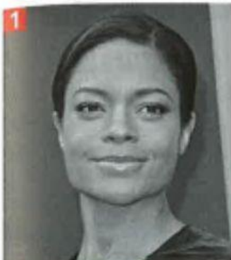
Naomie Harris, actress

7 Read about the people. Complete the paragraphs with his, her, our and their .