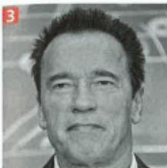
Arnold Schwarzenegger, actor and politician