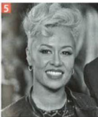
Emili Sandé, singer

Venus and Serena Williams are American. _____ parents are from the United States. _____ mother is from Michigan and _____ father is from Louisiana.