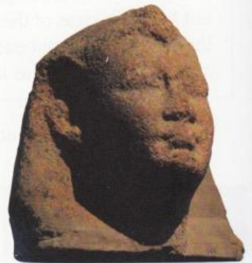
^ A sculpture recovered from what is thought to be Cleopatra's palace

But staying in power was not an easy 4. (task / role) . Cleopatra had many enemies 1 who eventually took power from her. In the end, the queen was too 5. (ordinary / proud) to surrender 2 and instead chose to kill herself. Her legend survived, however, and today Cleopatra remains a(n) 6. (timeless / according) symbol of ancient Egypt.