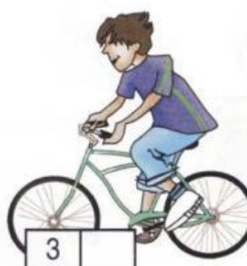
C the girls' brushes