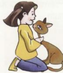
the girl's cat

We use s' with more than one person or animal.