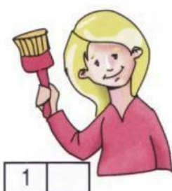
A the boy's bike