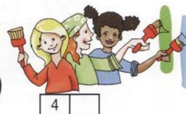
D the boys' bikes