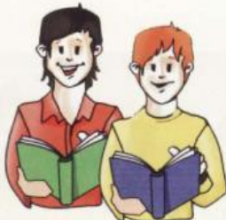
the boys' books

We use s' with more than one person or animal.