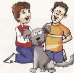
the children's dog