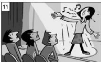
11 She's singing really _____.