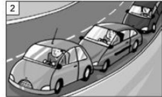
2 He's driving really _____.