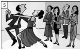
5 They're dancing very _____.