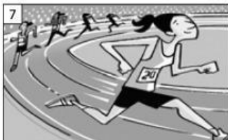
7 She's running very _____.