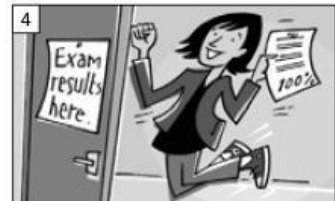
4 She passed the exam very _____.