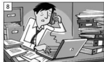
8 He's working _____.