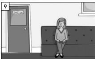
9 She's waiting _____.