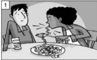
1 She's eating very noisily .

b Write sentences for pictures 1–12. Use an adverb from a.