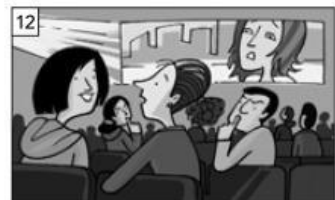
12 They're talking _____.