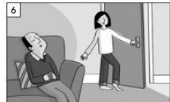
6 She's opening the door _____.