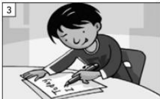
3 He's writing _____.