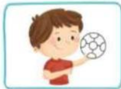
This is a ball.