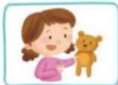
This is a teddy bear.