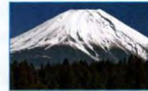
take photos / Mount Fuji