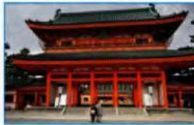
visit / Buddhist temple