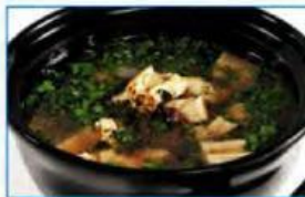
taste / Japanese soup