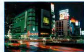
look round / Tokyo city centre