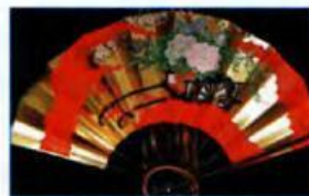
buy / elegant fan