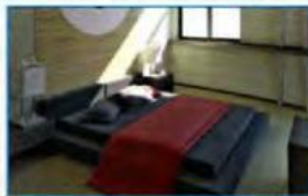
stay at / Emerald Hotel

Jane recently went on holiday to Japan. While she was there, she visited three different places and bought some souvenirs. Look at the pictures and the prompts below and say what Jane did, using a, an, some or the where necessary.