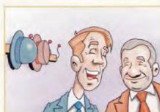
the men's hats