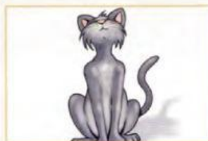
the cat's tail

We use s' with more than one person or animal.