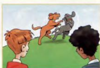
the boys' dogs

We use s' with more than one person or animal.