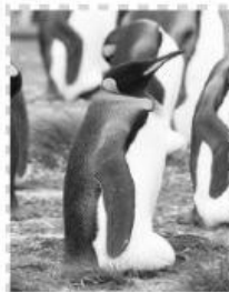
2. adventure/ documentary