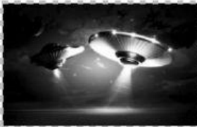
1. thriller/ science fiction