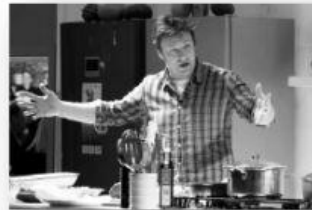
3. cookery show/ game show