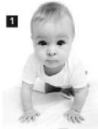
a big / small child

הסתכלו על התמונות והקיפו את שמות התואר המתאימים. אנחנו רוצים להוסיף את המילים הנכונות.