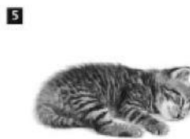
a tired / surprised cat