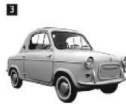
a new / an old car