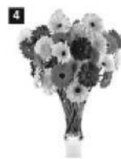
beautiful / awful flowers