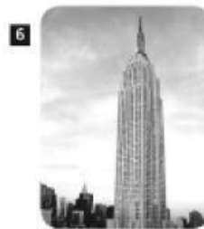
a tall / cheap building