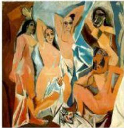
Les demoiselles d'Avignon (1907)