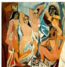
Les demoiselles d'Avignon (1907)