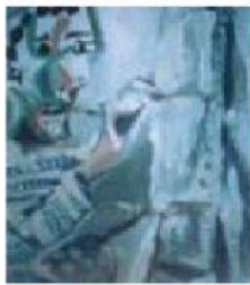
The artist at work (1965)