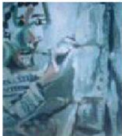
The artist at work (1965)