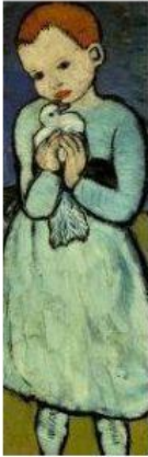
Child holding a dove (1901)