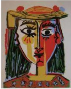
Lady with a hat (1962)