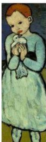
Child holding a dove (1901)