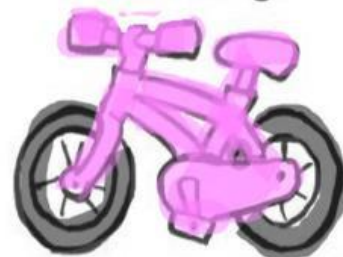
a pink bike