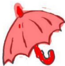
an orange umbrella