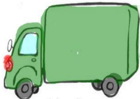
a blue lorry