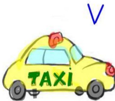
a yellow taxi