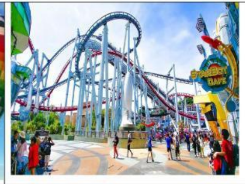
A day at a theme park