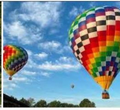
A trip in a hot-air-balloon