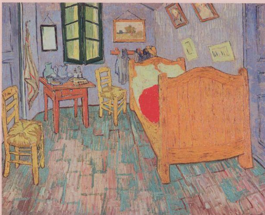
Vincent's Bedroom at Arles

a There is a picture next to this text. b a famous painting by Van Gogh of his bedroom at Arles. c a small room. d some furniture in the room. For example, there is a bed on the right of the picture. e a bed for one person. Above the bed f some pictures on the wall. Next to the door, on the left, g a chair. h another chair between the table and the bed. The table and chair are below the window. On the table i some objects – a jug, a glass and a bowl. Next to the door on the right j a towel on a peg. Behind the bed k some more things on the wall but l easy to see. Of course, m any modern things in the room and n very comfortable.