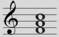
Triads of F Major