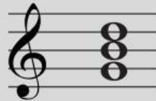
Triads of G Major