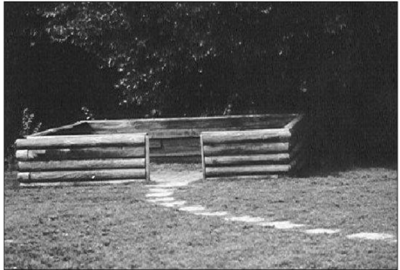
George Washington Carver was born into slavery in a small, dirt floor cabin on the Moses Carver farm. Though the original cabin was destroyed around 1881, archaeological digs have confirmed the site where the cabin once stood.

Day after day I spent in the woods alone in order to collect my floral beautis, and put them in my little garden I had hid hidden in brush not far from the house., As it was considered foolishness in that neighborhood to waste time on