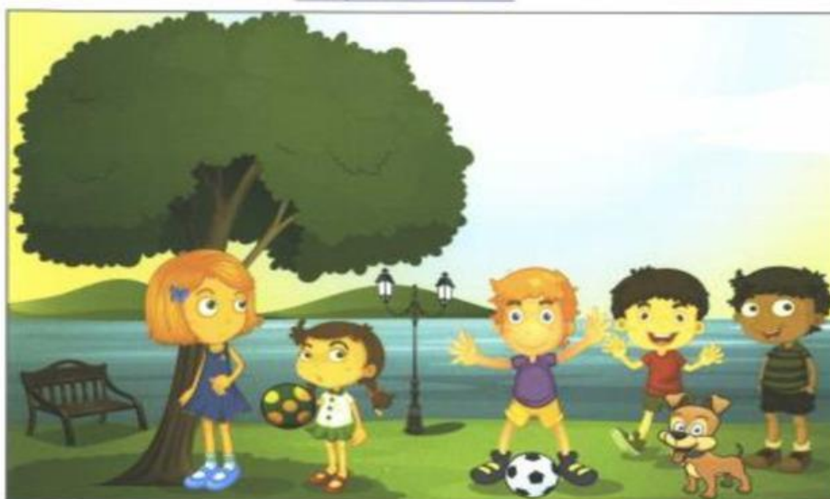
Katy's new ball

My name's Emma and I have a younger sister called Katy. Yesterday, we went to the park to meet my friends, David, Robert and William.