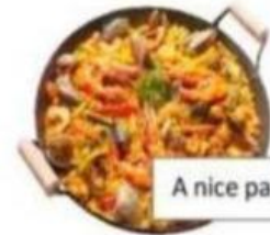
A nice paella

'Because I am the manager,' he answered.