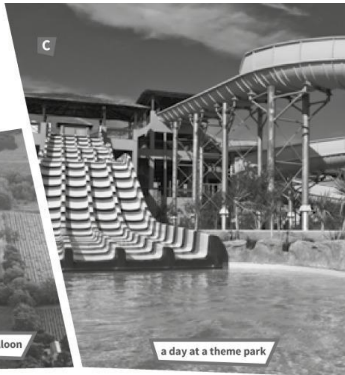
a day at a theme park