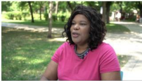
1. Vivica ____