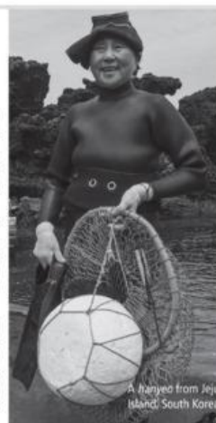
A haenyeo from Jeju Island, South Korea

In 2016, the United Nations Educational, Scientific, and Cultural Organization (UNESCO) put the haenyeo on a list of important cultures. Many people thought it was important to protect the work, so two schools opened to train new haenyeo . To work as an official haenyeo , you need the support of the local haenyeo group in a fishing village first. This can be difficult as there are fewer fishing villages than before.