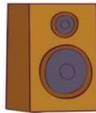
4 s _____