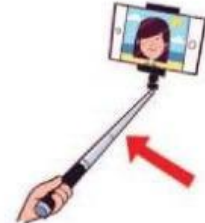
6 s _____ s _____