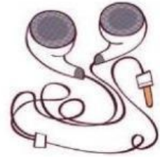
3 e _____