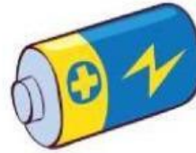
2 b _____