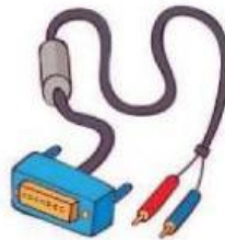
7 c _____