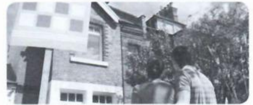
1 They're going to move house.

become famous get a lot of money get married have a surprise move house travel to different countries