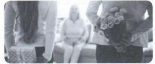
2 She's going to get married.