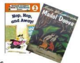
(English Story book)

Then the English story books will come to their respective shelves..