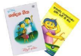
(Children's poetry book)

Then the children's poetry books will come to their respective shelves.