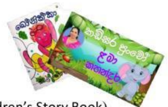
(Children's Story Book)