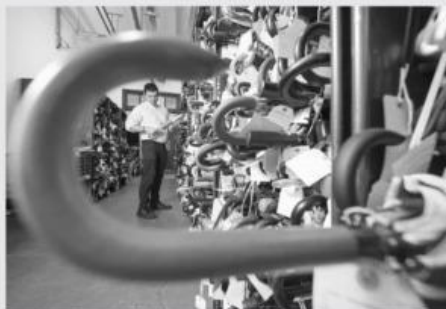
The Transport for London Lost Property Depot

Every year, people lose thousands of possessions. Many big cities have a lost-and-found facility. If you find something, you can take it to this place. And if you lose something, you can go to the lost and found and look for it. Here, we look at two of the biggest lost and founds in the world: in London and Tokyo.