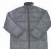
10 a c