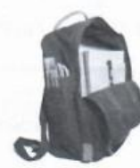
9 a b