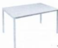
4 a t