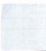
11 a p of p