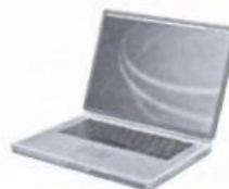
2 a l