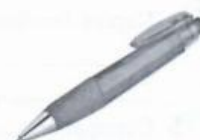
3 a p