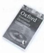
8 a d y