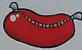
2 pencil case