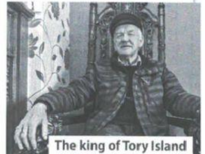
The king of Tory Island