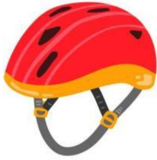
a red helmet