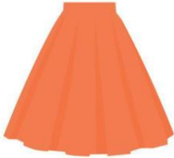
an orange skirt