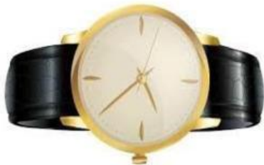
a black watch