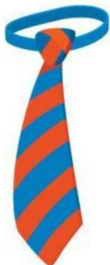
a blue and red tie