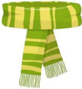
a green scarf