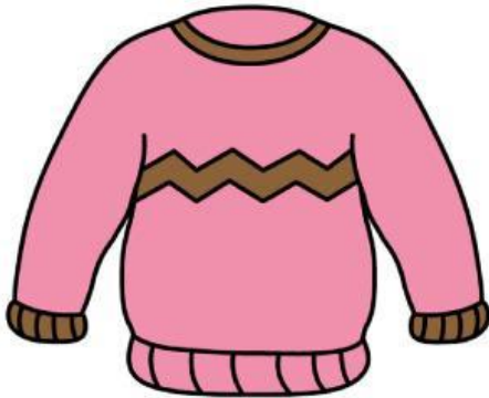
a pink sweater