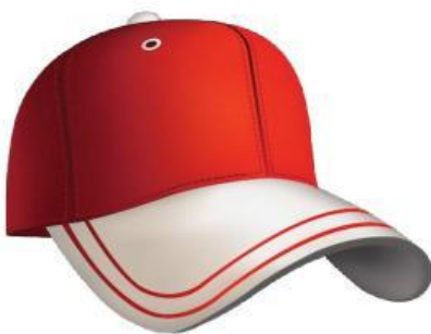
a red and white cap