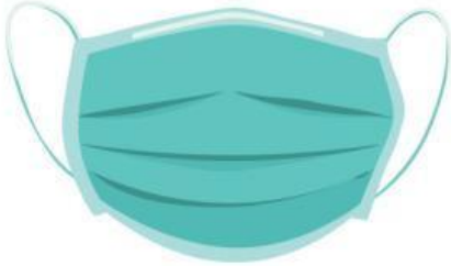
a blue mask