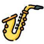
Play the saxophone