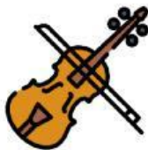
Play the violin