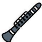
Play the clarinet