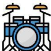
Play the drums