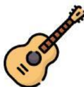
Play the guitar