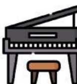
Play the piano