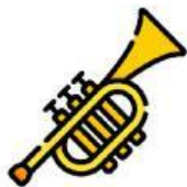
Play the trumpet