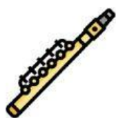
Play the flute