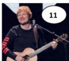
I sing and give concerts.