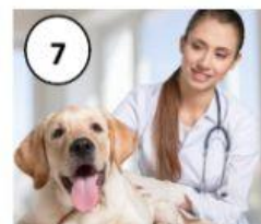
I treat sick animals.