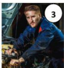
I repair vehicles and machines.