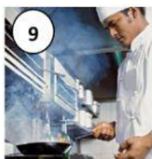
I prepare food in a restaurant.