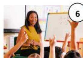
I teach in a school.