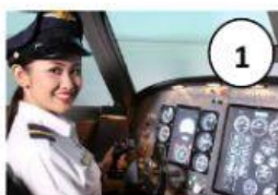
I fly an aircraft.