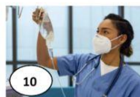
I care for people who are ill in a hospital.