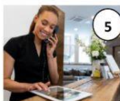
I welcome guests in a hotel.