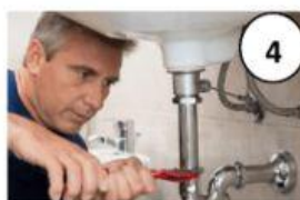
I repair water pipes.