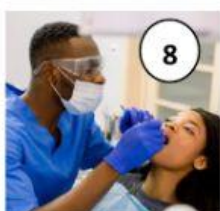
I treat people's teeth.