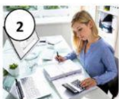
I prepare the financial records.