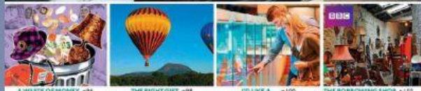
A WASTE OF MONEY p95