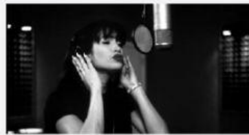
Jennifer Lopez acting in the movie Selena

The movie stars Jennifer Lopez as Selena. I think she was excellent. It was one of her first movie roles. I feel that Jennifer Lopez's acting is very good. You believe she is Selena. Lopez is also a great singer, but she doesn't sing in the movie. The singing voice you hear is Selena's.