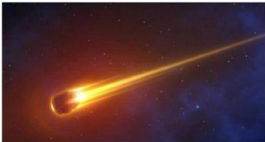
"Shooting stars" are differently sized pieces of rock or space dust that enter Earth's atmosphere.