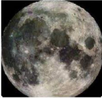
Earth's only natural satellite