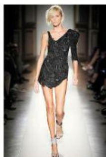
d) ( )