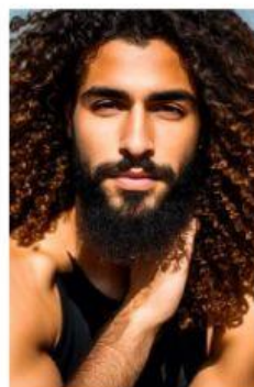
c) ( )