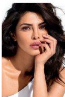
e) ( )