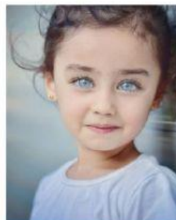
f) ( )