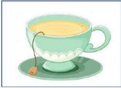
A cup of tea