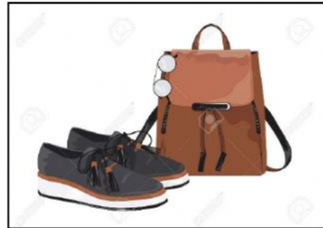
Document 1: Leather shoes and bag

Cows are important animals for humans. They give us milk and meat . Cows give humans other benefits like using its skin to make leather handbags and leather shoes .