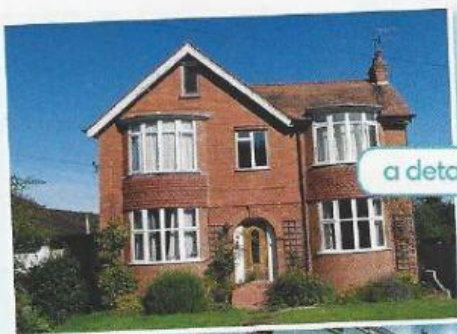
a detached house

a in the city b in the country c in the city and in the country