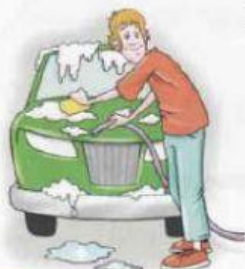
wash the car