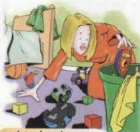
tidy the house