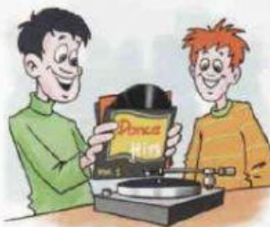
listen to music