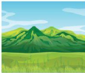
2. m _ u n t _ i _ _