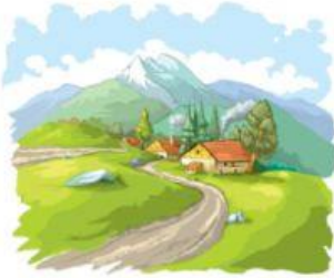
1. v i _ _ a g _