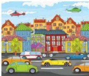
5. _ i t _