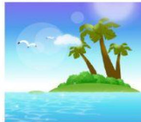
7. _ s _ a n _