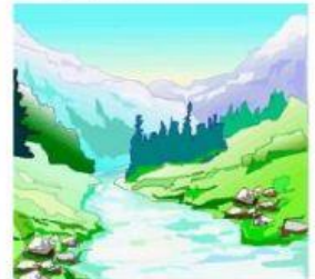
8. s _ r e _ m