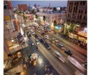
4. a _ e n _ e