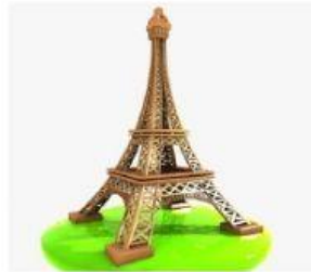
3. t _ e _