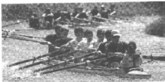
Members of the rowing team in a boat race

Management gurus often compare business to sport. They sometimes use examples from football or rugby when they talk about teamwork. But it isn't often that they say that rowing has lessons for business.