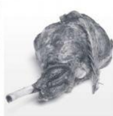
4 r l _____