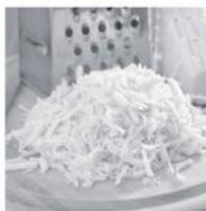
6 gr ch _____