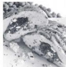
5 st ch br _____