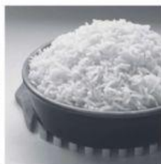
7 b r _____