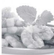
8 p pr _____