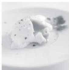
1 poached egg _____