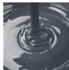
10 m ch _____