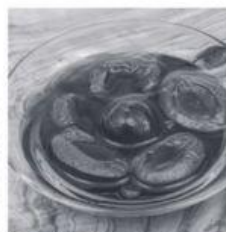
9 st pl _____