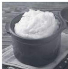
2 m p _____