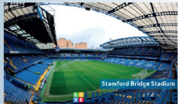
Stamford Bridge Stadium

The girls were a bit surprised, and they asked the taxi driver where they were. 'In Stamford Bridge,' he said. 'Where did you want to go?'