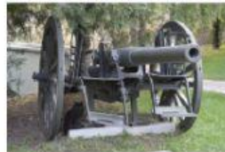
A field gun