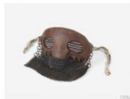
A protective mask