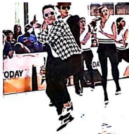
▲ Psy performed "Gangnam Style."

15 In 2007, YouTube was just beginning. A user uploaded 7 a clip 8 called " Dramatic 9 Chipmunk ". In the video, we hear thunder, and then the animal turns to the camera looking shocked. Viewers of all ages and nationalities 10 found it funny. The video lasts only six seconds, but the 20 little chipmunk is still well-known today.