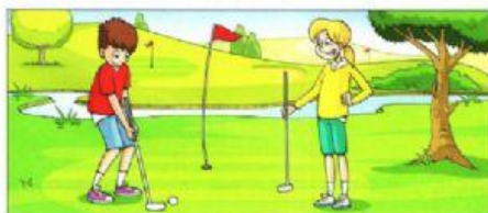
The golf ball

Richard and Emma are friends. One day, Richard said, 'Emma, would you like to play golf?' 'Yes,' said Emma. 'Let's go to the park by the river!' Emma was brilliant at golf, and the ball went a really long way when she hit it.