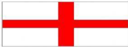
England (Cross of Saint George)