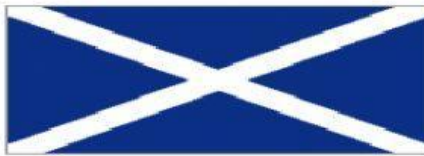
Scotland (Cross of Saint Andrew)