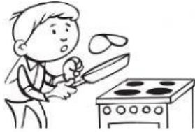
He likes / doesn't like cooking