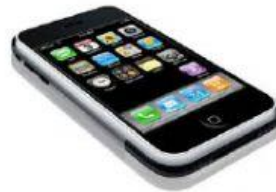
a cell phone