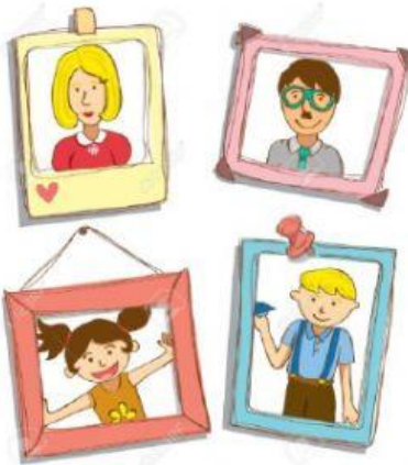
photographs = photos