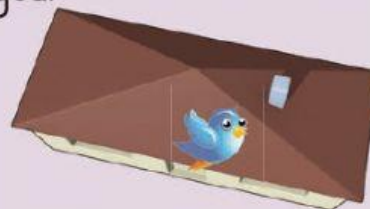
Top view of building.