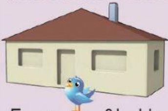
Front view of building.

Where is the bird standing? The words will help you.