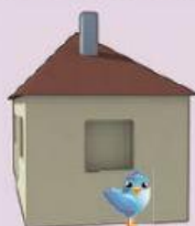
Side view of building.